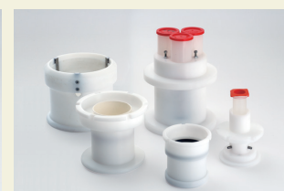
Wide range of adapters