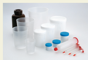
Wide range of containers

Ointment container, Disposal cup, Blow molding bottle, Stainless container, Paper container, Syringe, barrel, Glass bottle, Centrifuge tube, others.