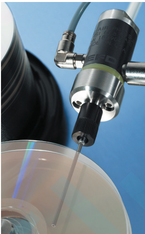
752HF bonding DVDs with UV-cure resins.

The 752HF valve system is specifically designed for precise dispensing of UV-cure resins and similar fluids used in media manufacturing of Blu-Ray DVDs, DVDs and CDs. Unrestricted material flow reduces turbulence and the formation of micro bubbles.