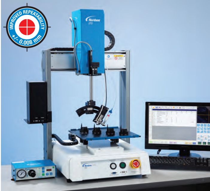
RV Series makes 4-axis dispensing automation more intuitive with proprietary DispenseMotion software.

Easy 4-axis automation for precise fluid application with smart vision