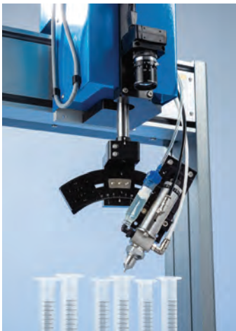
Smart vision CCD camera verifies workpiece presence and orientation.