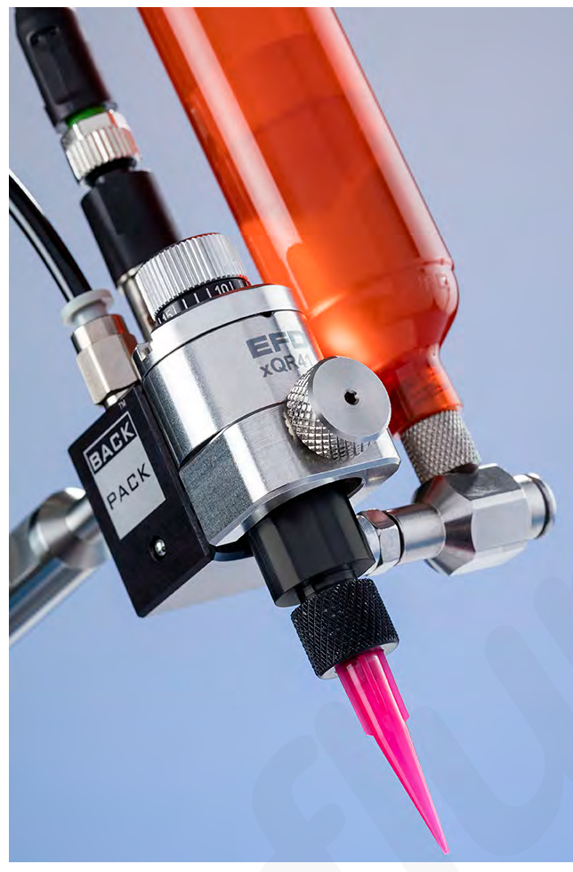
The xQR41V can be used with any Nordson EFD dispense tips to apply a wide range of fluids.

Needle valve system for precise, consistent fluid control